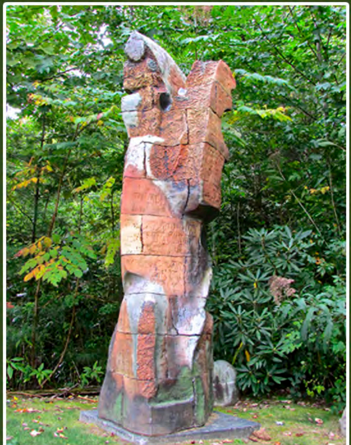
ROBERT PULLEY "TOWER OF REMEMBERING" 2007 STONEWARE CLAY AND STEEL 9.5'H X 4'W X 3'D $12,000.00

FORGED/ FABRICATED STEEL AND CYPRESS 9'H X 3'W X 8'D $15,000.00