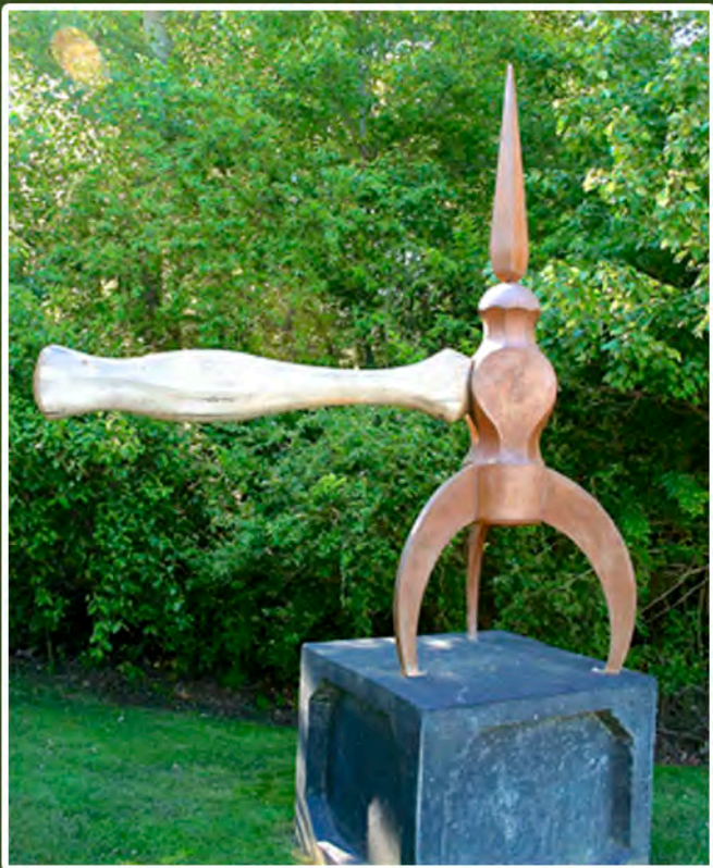
ANDREW T CRAWFORD "LAUNCH" 2005

FORGED/ FABRICATED STEEL AND CYPRESS 9'H X 3'W X 8'D $15,000.00