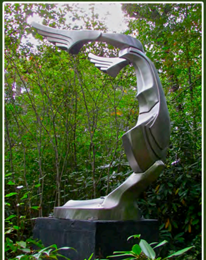
SCOTT STRADER "VOLAR"(SPANISH FOR 'IN FLIGHT') 2008

STAINLESS AND RECYCLED STEEL 16'H X 20'W X 20' $18,000.00