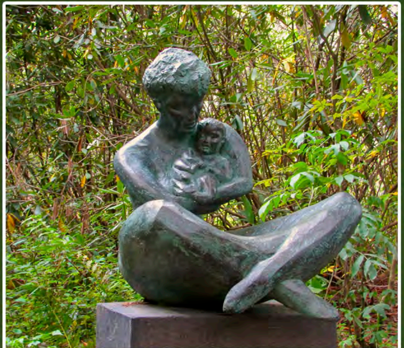
MARGOT McMAHON "GRANDMOTHER AND BABY" 1994 RESIN 4'H X 5'W X 3'D $13,500.00

STEEL WITH PATINA 13'H X 9'W X 11'D $19,800.00