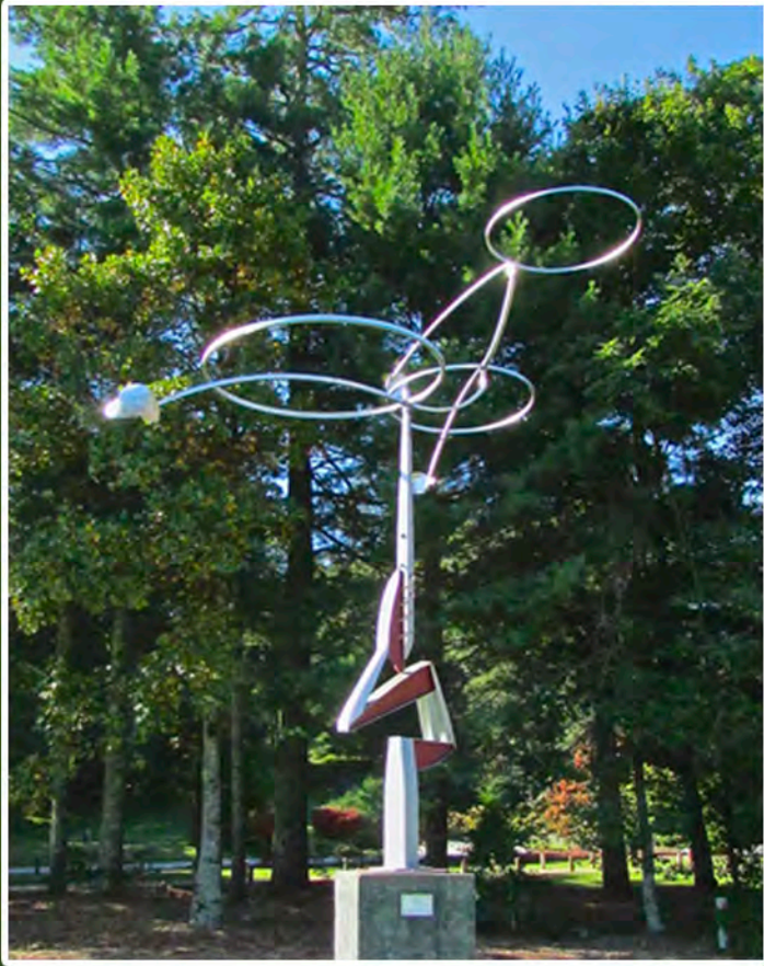
MIKE ROIG "THE WATCHTOWER" 2005

STAINLESS AND RECYCLED STEEL 16'H X 20'W X 20' $18,000.00