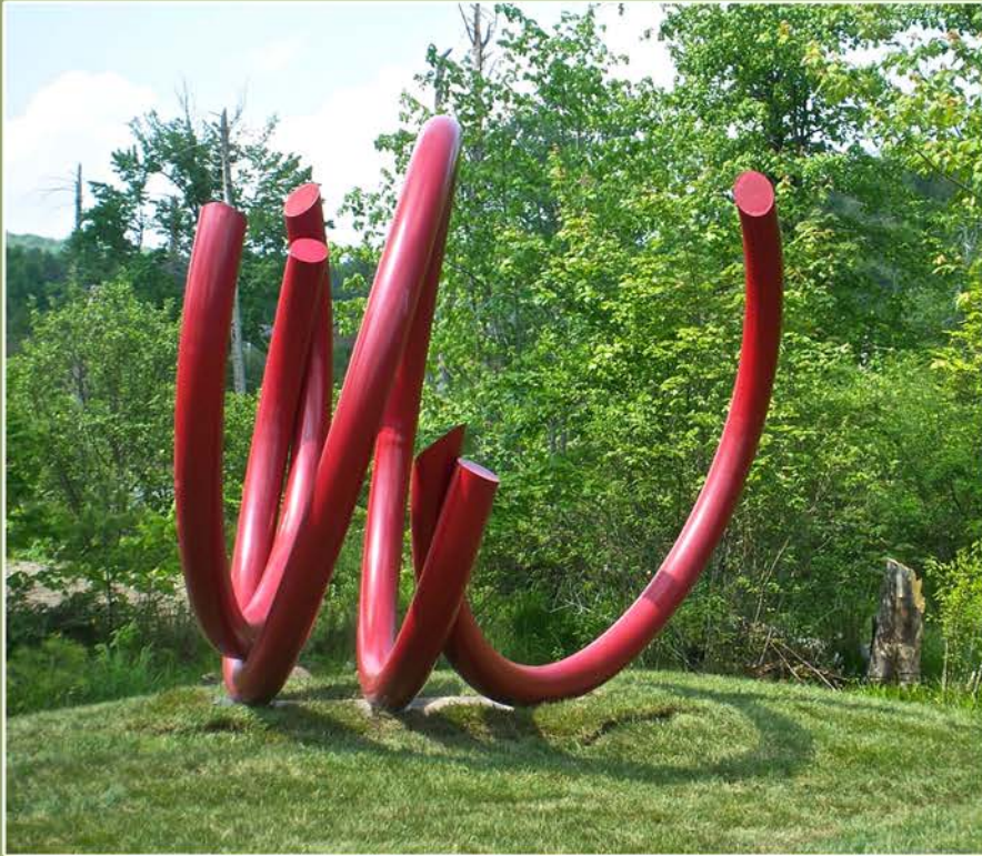
JOHN CLEMENT "JUICY FRUIT" BENT AND WELDED STEEL INSTALLED 2007 10'H X 11'W X 16'D

SCULPTURE ON THE GREEN PERMANENT COLLECTION